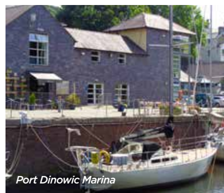
Port Dinowic Marina

"We've chosen to work with Inland and Coastal Marina Systems as not only do they produce quality durable pontoon systems, but the team is keen to work with, and utilise, much of what currently exists, making the most efficient use of time and resources."