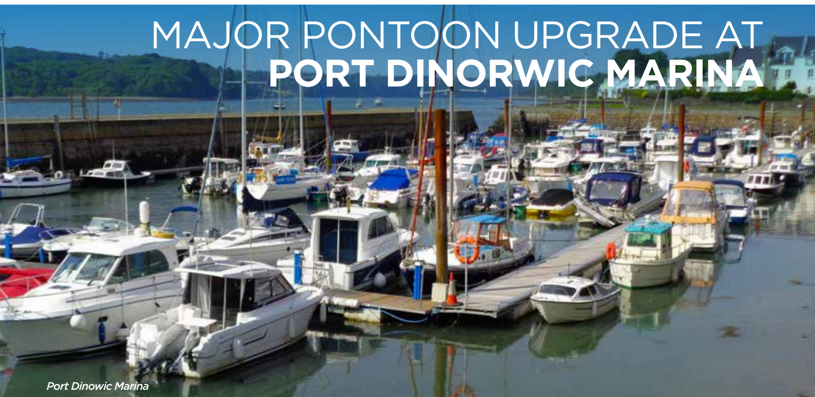
Port Dinowic Marina

As part of a major upgrade project, we'll be working with The Marine Property Group to completely refresh the marina hardware of its 180-berth Port Dinorwic Marina.