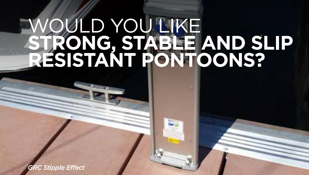
GRC Stipple Effect

Our GRC (glassfibre reinforced concrete) decking has fantastic anti-slip properties, and it doesn't rot.