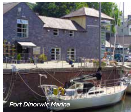
Port Dinorwic Marina

"We've chosen to work with Inland and Coastal Marina Systems as not only do they produce quality durable pontoon systems, but the team is keen to work with, and utilise, much of what currently exists, making the most efficient use of time and resources."