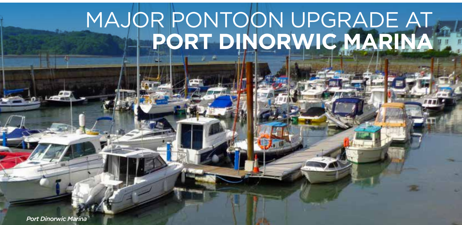
Port Dinorwic Marina

As part of a major upgrade project, we'll be working with The Marine Property Group to completely refresh the marina hardware of its 180-berth Port Dinorwic Marina.